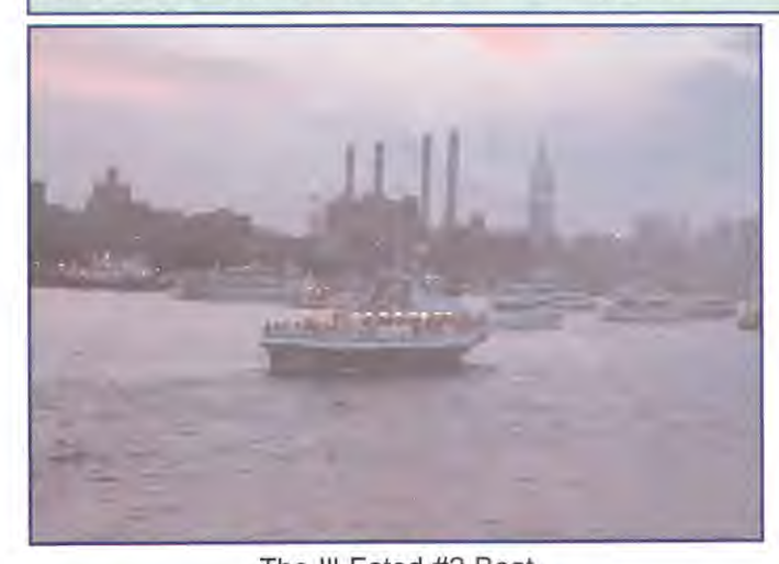
The III-Fated #2 Boat APPNA NEWSLETTER--Volume 12, Number 2

There will be a KEMC meeting in Lahore along with the meeting of Family Practice Physicians. The dates are December 15-19.