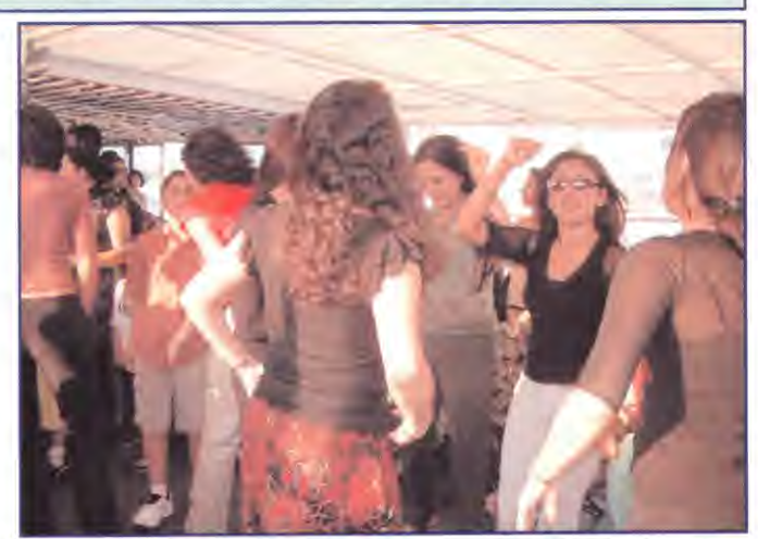
Some of the happy moments at the New York Meeting.