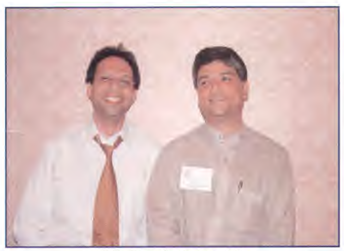
"We have had enough!"

Congratulations and best of luck to all of the office bearers