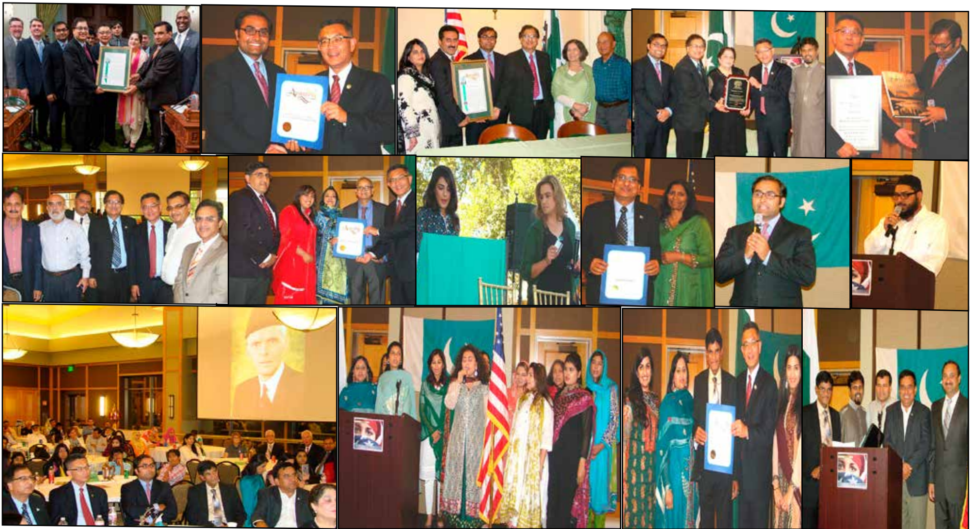
In the California Assembly, the framed document was presented to the leaders of the American Muslim Voice Foundation, a group recognized in Northern California (and beyond) for not only developing better understanding between all faiths, between Islam and America, but going beyond that step like feeding the homeless on Christmas Eve in Sacramento