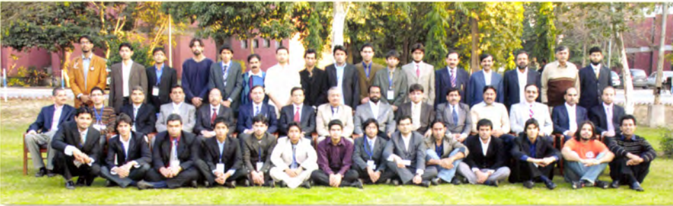
AIMCAANA leadership with the AIMC staff