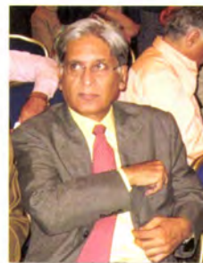
Aitzaz Ahsan at the 2008 AIMCAANA Social Forum