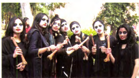
The monsters of AIMC