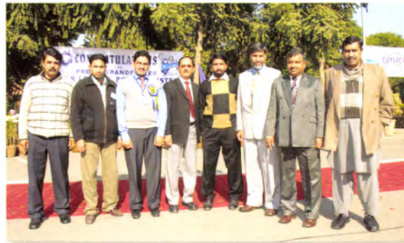
College Administration staff in December 2008