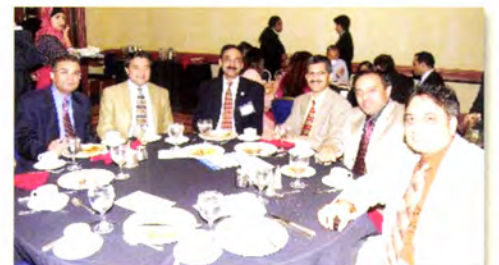
AIMCAANA Dinner at the APPNA 2008 Annual Summer Meeting