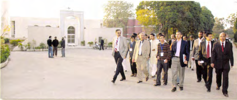
AIMCAANA leadership touring the college