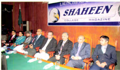
Inaugural ceremony of Shaheen 2008