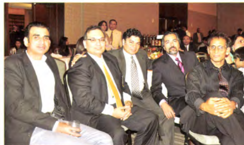
Iqbaliens at the APPNA 2009 Spring Meeting in Dallas