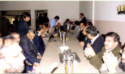
A meal at hostel mess during APPNA winter meeting At AIMC.