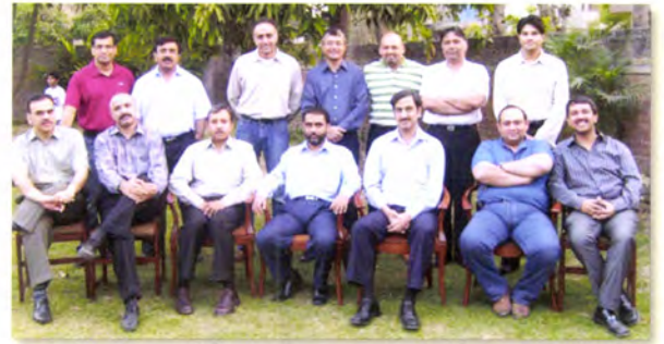
AIMC Class of 1989 Reunion