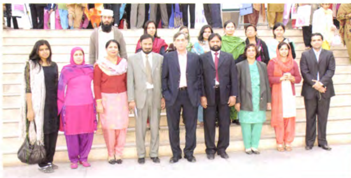
Participants and organizers of AIMCON 2008 and Convocation