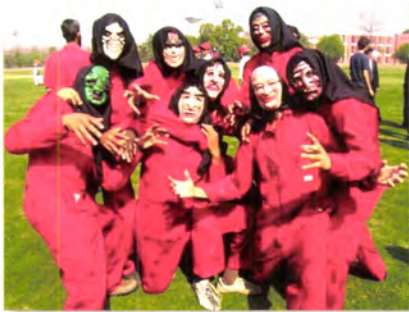
Ghost Day, AIMC Class 2005-2010