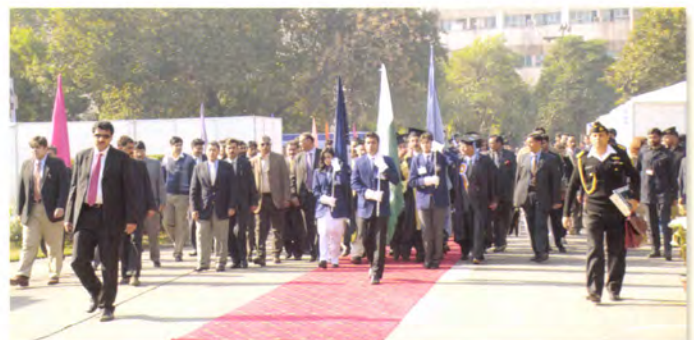
Convocation 2008 participants