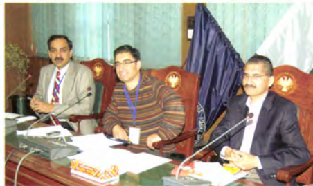
Election commissioners for local alumni elections 2008