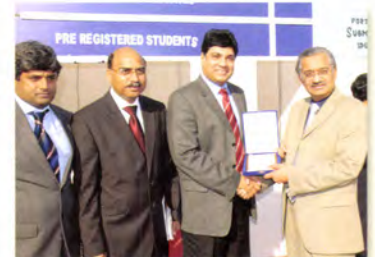
Exhibitors at AIMCON 2008