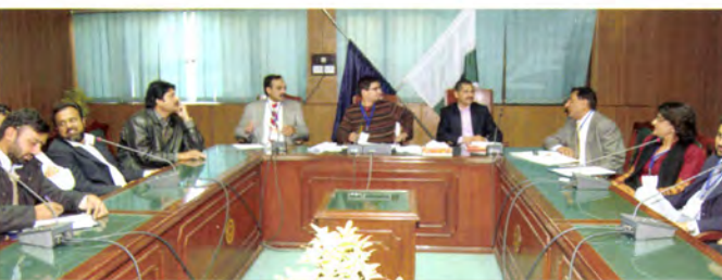
Allama Iqbal Medical College Alumni Association first Election in Progress