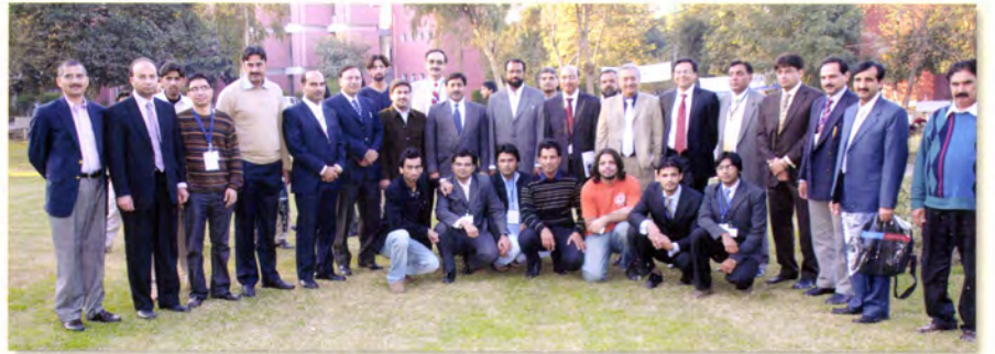
AIMCAANA delegate with local alumni and students