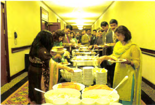
Dinner was actually served at the 13th Annual Alumni get together.