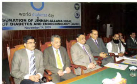
JAIDE Inauguration Ceremony, November 14, 2009.