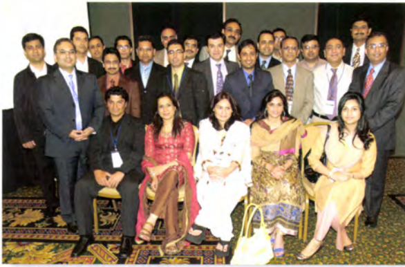
Iqbalians at the 13th Annual Alumni Dinner in San Francisco.