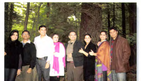
Iqbalians on APPNA Alaska Cruise