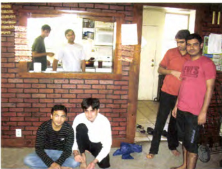
Boys at Iqbalian House in Upper Darby, Pennsylvania.