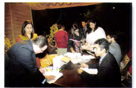
Reception desk at first AIMC alumni night in Lahore. Almost 400 local alumni participated in the occasion.