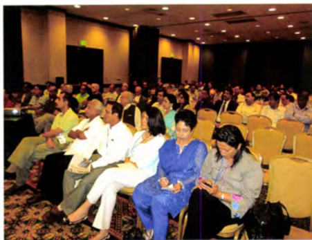
AIMCAANA social forum participants with Maleeha Lodhi.