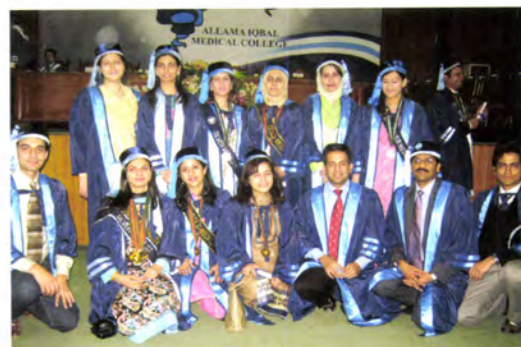
Class of 1997-2002 at Convocation