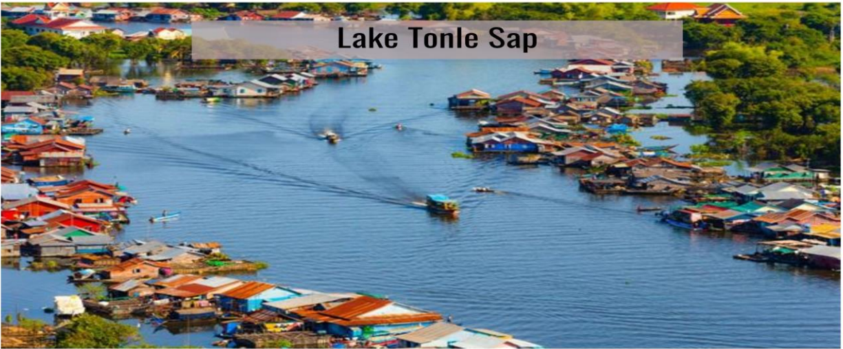
Lake Tonle Sap