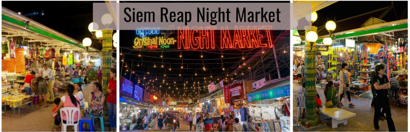
Siem Reap Night Market