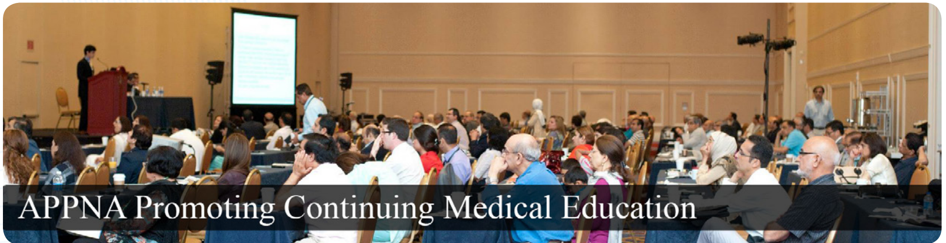
APPNA Promoting Continuing Medical Education

In addition to CME activities there will be seminars and panel discussions on various health and social issues. We also offer exhibiting space at the APPNA convention to a diverse spectrum of industry including but not limited to pharmaceuticals, biotechnology, investment, insurance, real-estate and not-for-profit organizations.