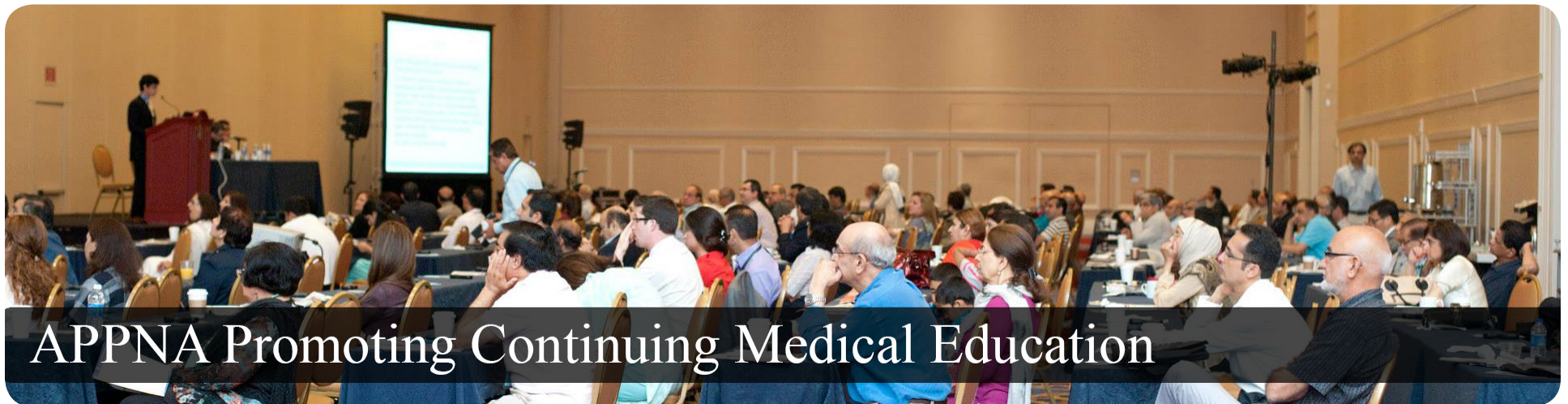
APPNA Promoting Continuing Medical Education

In addition to CME activities there will be seminars and panel discussions on various health and social issues. We also offer exhibiting space at the APPNA meetings to a diverse spectrum of industry including but not limited to pharmaceuticals, biotechnology, investment, insurance, real-estate and not-for-profit organizations.